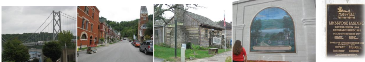
Tom’s Cabin”; Home of 3 rd Regt-Kentucky Militia commanded by Wm Henry Harrison; Oldest Post Office in the US; Russell Theater-location of Rosemary Clooney’s first movie